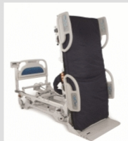
Figure 3, Upright body position