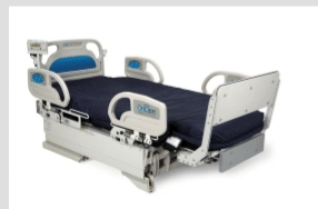
Figure 2, Supine